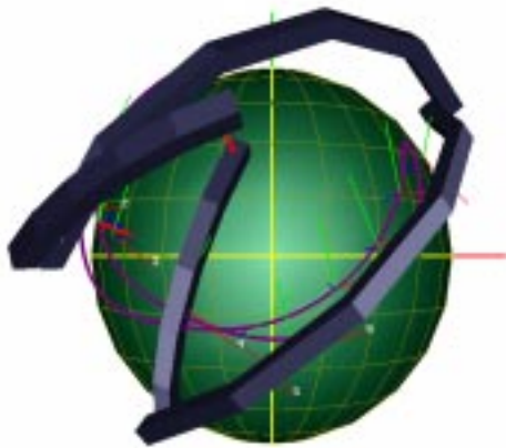
Figure 1. A spherical four-bar linkage that approximates a set of 10 spherical displacements.

The quality of the above approximation is expected to be dependent on the shape of the given NURBS spherical motion. This is because while NURBS curves are free-form curves that can be used to model any curve shape, the image curve of a spherical four-bar is constrained by the kinematic structure of a four-bar closed-chain. This gives rise to the third problem in algebraic motion approximation, i.e. how to fit a small number of data points with a NURBS motion while maintaining the kinematic constraints of a four-bar motion. This problem may be solved by first finding a NURBS motion that fits the given data with more control points than necessary and then determining the extra control points such that the final NURBS curve fits the kinematic constraints of a four-bar motion.